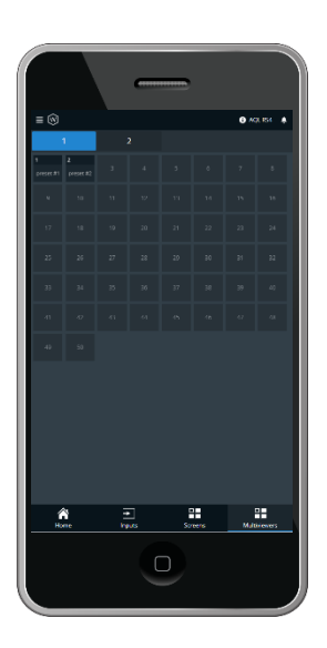
The Web RCS is compatible with any device or platform, including iOS and Android devices